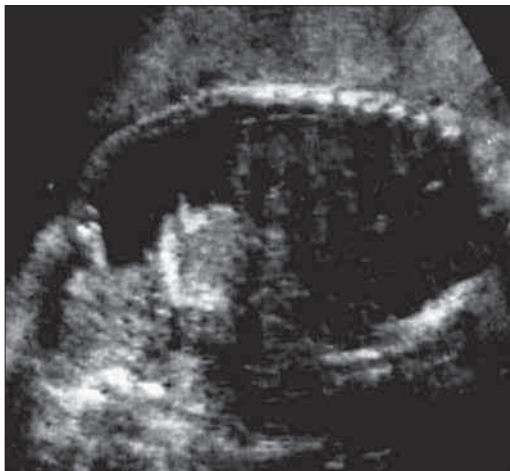
Figure 1a: Single live intrauterine fetus at 36 weeks of gestation without polyhydramnios and pericardial effusion