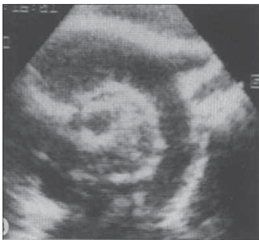
Figure 2: Echocardiogram at 49 day of the baby's age showing that there was a prominent calcification of the aortic arch, right pulmonary artery (RPA), innominate artery (IA), left carotid artery (LCA), and left subclavian artery (LSA)

The family was planning for the second conception; however, wanted to have an objective and measurable understanding about the risk of recurrence in a subsequent pregnancy. For this purpose the family was referred for a genetic counseling to the Molecular Biology and Cytogenetics lab, Apollo Hospitals, Hyderabad, India. After one year of the first baby's demise, the mother conceived for the second time, and the pregnancy was closely monitored. A detailed genetic analysis was carried